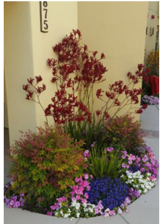
Above: Morro Del Mar HOA by KD Janni Landscaping, winner of the Small Commercial Maintenance Award in 2016.

Join us at the Awards Banquet on June 20 at Flying Caballos Ranch in San Luis Obispo. Entries will be due May with judging to take place at the end of May.