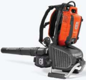
550iBTX BACKPACK BLOWER