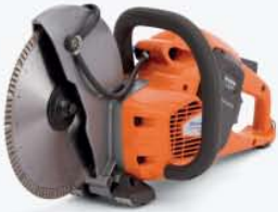
K535i POWER CUTTER