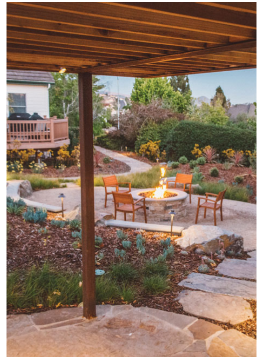
Above: The Zigelman Residence by Purlieu Landscapes, winner of the Sustainable Landscape Installation Award in 2017.

Join us at the Awards Banquet on July 10 at Flying Caballos Ranch in San Luis Obispo. Watch for applications and entry deadlines to be released soon.