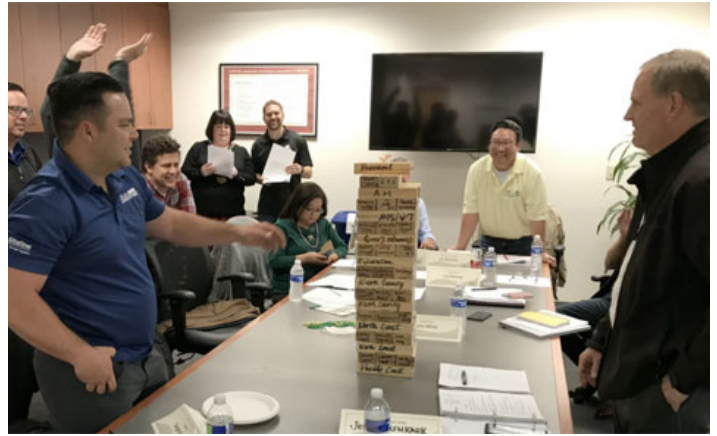
Team building strategies at the Chapter Presidents Council Meeting.

Sometimes small things turn out to be big. For example, when we were curious about using a business software to help manage our company, we learned