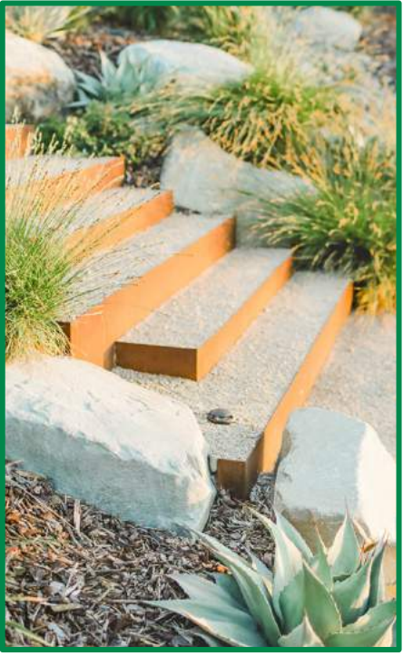
Volume 34, Issue 3 April 2024

Food and drink available for purchase (cash only). Fish cleaning is included, but tipping the crew is customary. No ice chests, fire arms, alcohol or illegal drugs, please.