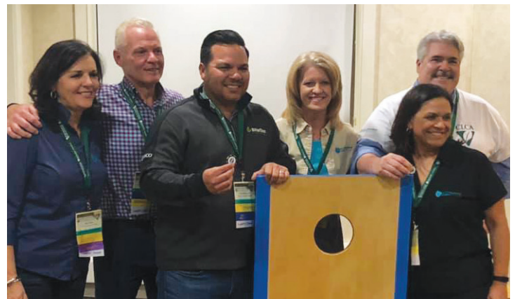
At left: Convention attendees participated in an exercise to help determine the future path of CLCA.